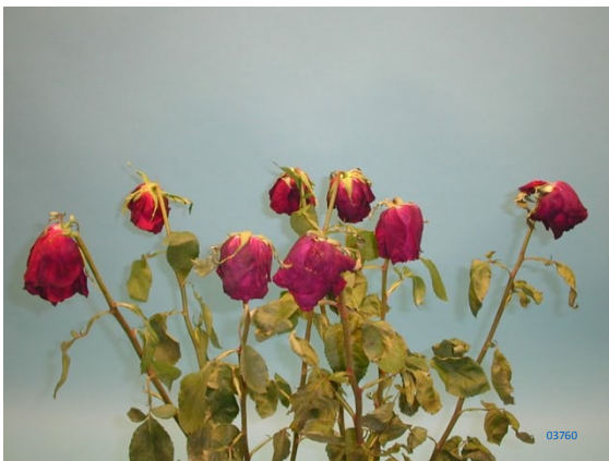
Treatment: water Total vase life: 1 days Photo taken: day 4