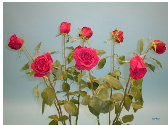
Treatment: Chrysal RVB Total vase life: 4 days Photo taken: day 4